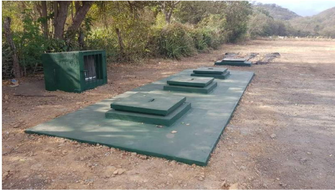
Septic Tank System